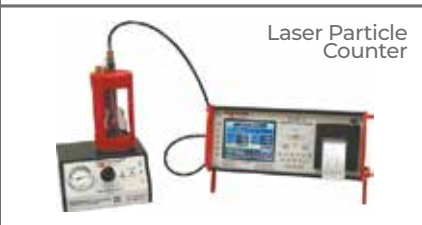
Laser Particle Counter